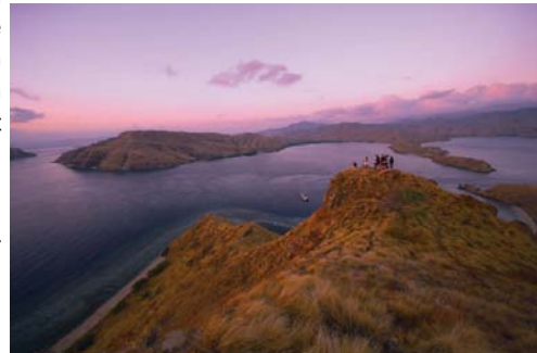
Komodo Island.

The islands and people of Indonesia constitute the fourth most populated nation in the world. As a democratic republic, Indonesia is divided into 27 provinces and special territories and classified geographically into four groups. Bali is part of the Lesser Sundas, a chain of small islands stretching eastward.